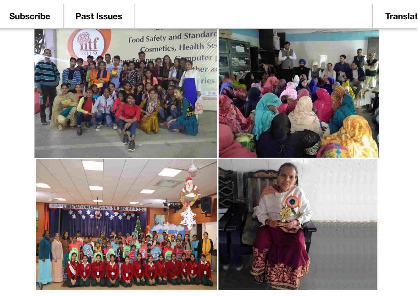
Street Education Programme

Butterflies organised a training program for 14 teachers of a government school in Chandni Chowk. The training program consisted of sessions on communication skills, physical, cognitive and emotional development of children; biological, physical and social changes among children; causes and consequences of interest and disinterest among children; behavioral responses for various situations in adolescence period.